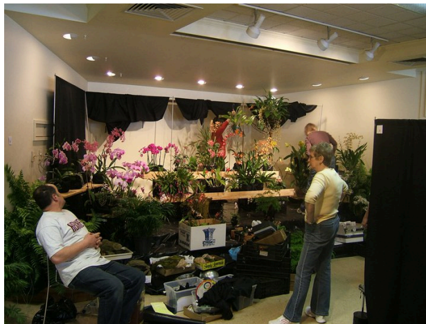
2011 Orchid Show Set up!