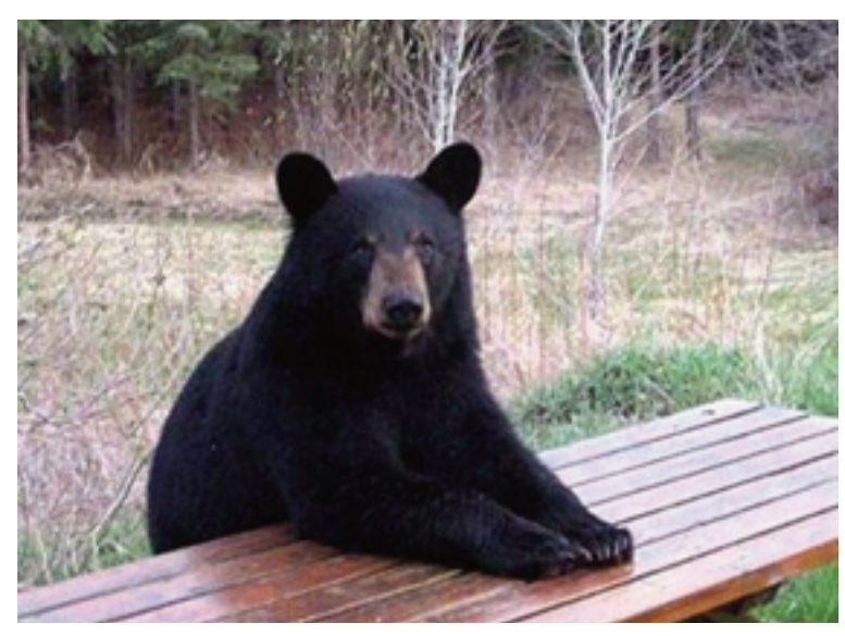
I'll have two pic-a-nic baskets please.

Timothy C. Choltco 1866 Bull Creek Road Tarentum, PA 15084-3018 harbingerorchids@yahoo.com 814-574-2551