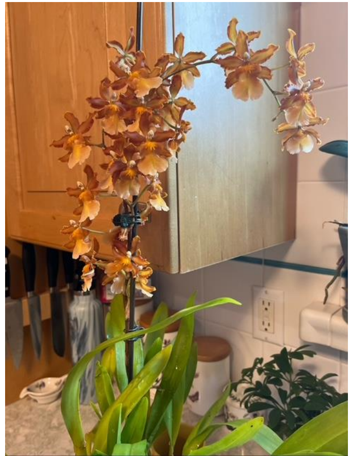
Odontocidium Catatante ‘Sunny Kalapana’