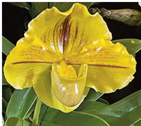
Paph. Saturday Night