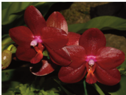
Phal Sogo Grape 'Fireball'