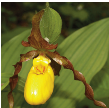
Cyp calceolus var pubescens