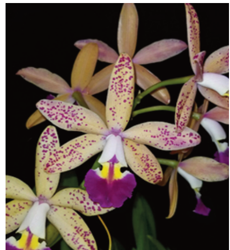
Cattleya Tropical Pointer 'Cheetah' AM-AOS, BM-JOGA [syn. Lc.] (Tropic Glow x intermedia)