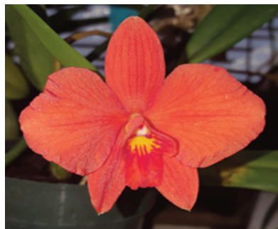
Cattleya. Red Jasper [syn. Slc.] (Red Jewel 'Naranja Jewel' x coccinea 'Marlow Orchids').