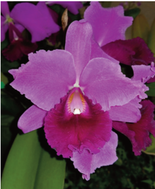
Cattleya Betty Ford 'York' [syn. Lc.] (Barbara's Delight x Nigrescent)