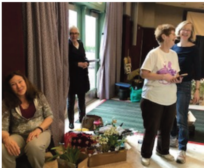
The girls of OSWP at the West Shore Show setting up the society exhibit and it got Best Society Exhibit .